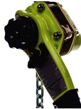
Oversized laser etched stainless steel nameplate with required ASME/OSHA WARNINGS