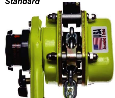
Open chain guard allows visual inspection and does not trap contamination.