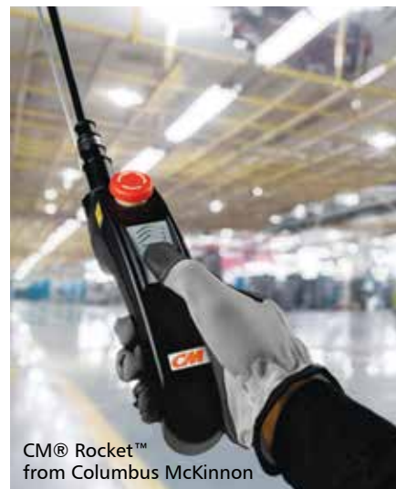
CM® Rocket™ from Columbus McKinnon

The CM Rocket's curved, well-balanced shape fits comfortably in the palm of your hand, requiring minimal